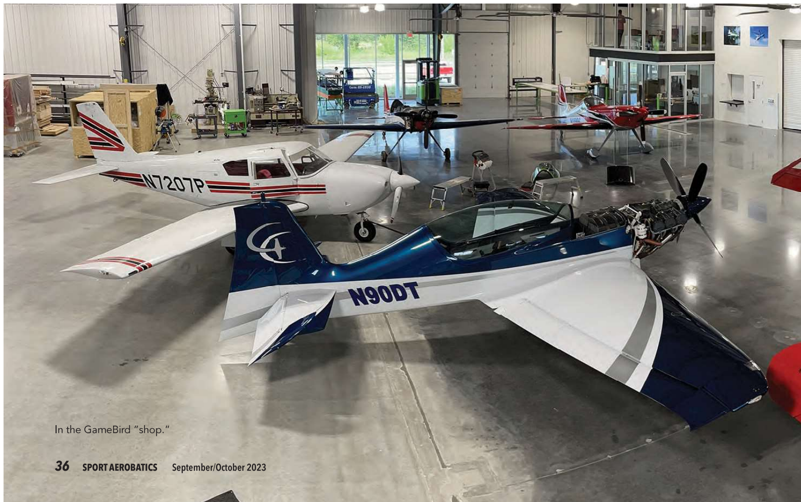
In the GameBird "shop."

These buyers are not world competitors or air show performers. In the near term, the Unlimited category will likely continue to be dominated by single-seat monoplanes like the MXS and particularly the Extra 330SC. In this sense, Extra has definitely cemented its place in aviation history. Experienced,