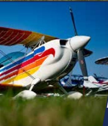
ACRO SPORT II