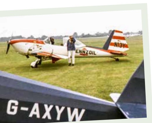
▲ Scholl Super Chipmunk 1970, Booker Field, prior to WAC.

The more dangerous part of G-LOC the military researchers discovered was the time to recover. Both the Navy and Air Force researchers found the average duration of incapacitation was about 15 seconds, which does not count the amount of time for each test subject to become reoriented after they woke up. When G-LOC occurs, easily 20 to 30 seconds can go by before the pilot regains control of the airplane. If you were going a 120 mph, or 176 feet/second, you will travel 3,500 to 5,280 feet in 20 to 30 seconds. That is not a lot of distance, unless you were lucky enough to be flying straight and level. The FAA research did recognize that a pilot knowing the maneuvers to be flown can anticipate and prepare for the onset of the g-forces. This gives an estimated 1.4g increase over centrifuge testing numbers.