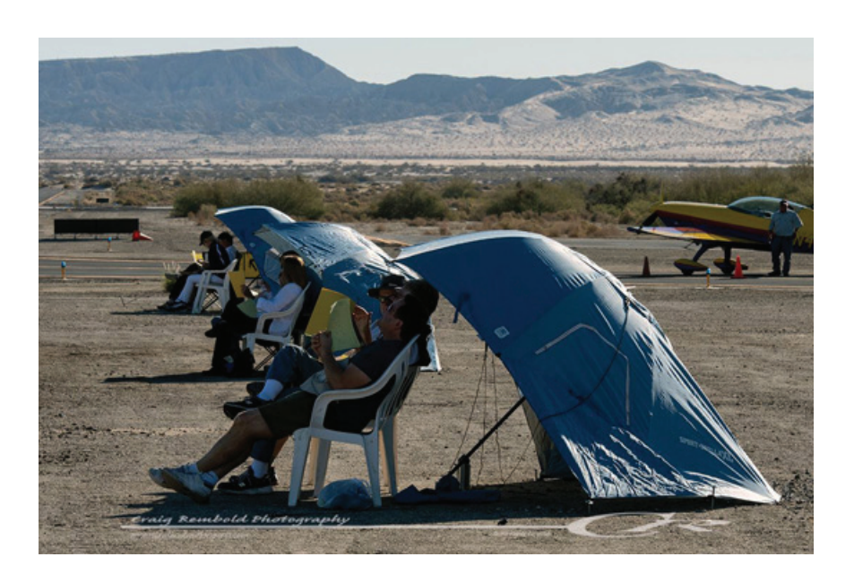
A judging line