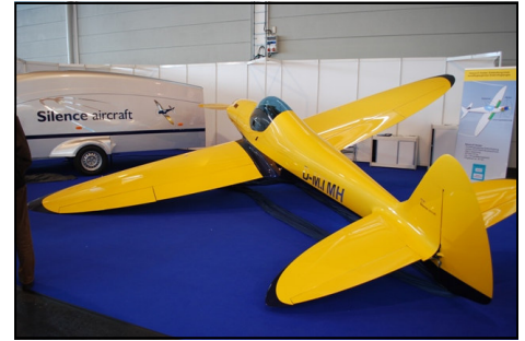
The Spitfire-like composite e-Twister from German Silence Aircraft is poised to become the first-ever electric-powered aerobatic aircraft.

For aerobatic pilots, the most electrifying aircraft on display (pun intended!) was the German Twister from Silence Aircraft (www.silence-aircraft.de). This all-carbon design bears a striking resemblance to a Spitfire and has been available in kit form for several years. Search YouTube for "silence twister" for examples of its aerobatic abilities, remembering that its Australian Jabiru 2200 powerplant is produces only 80 HP.