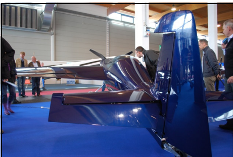
Corvus Aircraft of Hungary brought the prototype of their new Racer 540 to AERO, specially designed for Red Bull racer Peter Besenyei.

The Italian company Alpi Aviation (www.alpiaviation.com) displayed their new four-seat Pioneer 400 and the Syton helicopter. All Alpi aircraft feature an all-wood