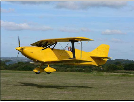
The FK-12 is a light-weight Rotax-powered two-seat aerobatic aircraft manufactured by FK Lightplanes of Speyer, Germany.

lightplanes.com) is a light weight, two-place aerobatic biplane powered by 80hp or 100hp Rotax engines. It features folding wings with flaperons on all four, quick conversion from open to closed cockpits, and a mixed metal/composite/fabric construction stressed to +9/-3.4 g. With a MTOW of 1146 lbs. the two-place FK-12 has an impressive ROC of 1400 fpm on only 100hp.