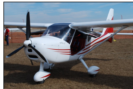
Ukrainian-built S-10 Swift from Skyeton Aircraft, one of the new S-LSA aircraft seen at the Sebring EXPO. Back home it is used for aerobatic training.

Light Sport aircraft per se are not forbidden from being aerobatic-capable, and (as far as I know) there is nothing in the Sport Pilot Certificate that would forbid an "SP" licensed pilot from performing aerobatics in an LSA-compliant aircraft. But it is rather unlikely. Interestingly though, a number of the European LSA craft shown in Sebring are also licensed in higher-performance categories back home. Some are even available with retractable landing gears and variable-pitch propellers, two