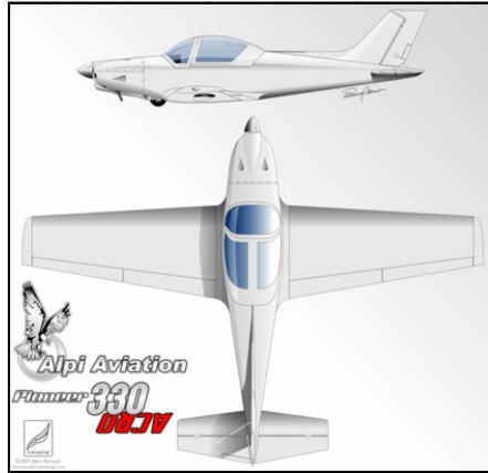
Italian Alpi Aviation's unique series of wood/composite light aircraft includes the Pioneer 330 Acro.

wing and a wooden fuselage covered with two large streamlined carbon fiber shells. Their 100 HP Rotax 912S powered Pioneer 330 Acro is a low-cost two-seat side-by-side aerobatic trainer with retractable landing gears that is stressed to +6/-3 g. With a variable-pitch prop, cruise speed of 150 mph, range of 621 miles and payload capacity of 44 pounds, the airplane makes also for a decent cross-country ship. (see page 8.)